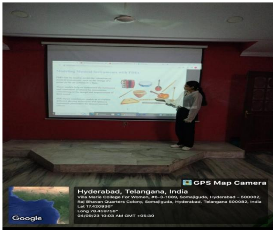
Presentations by students