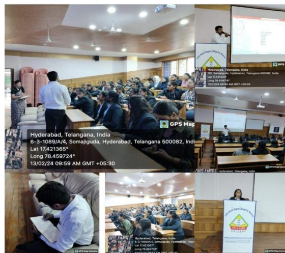
Guest lecture in Statistics