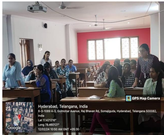
Students taking part in Quiz