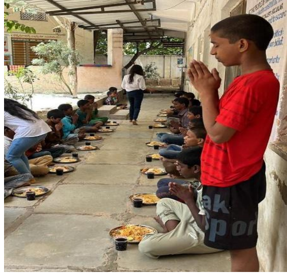
Mid day meal Program