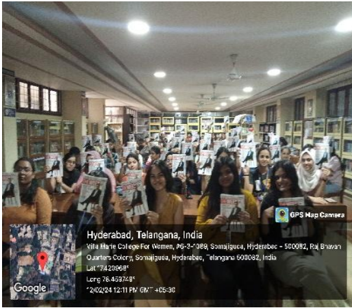
Interaction with The Week Magazine