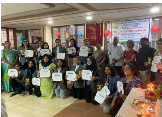
Book Review Competition