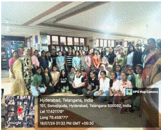
Library Induction Program