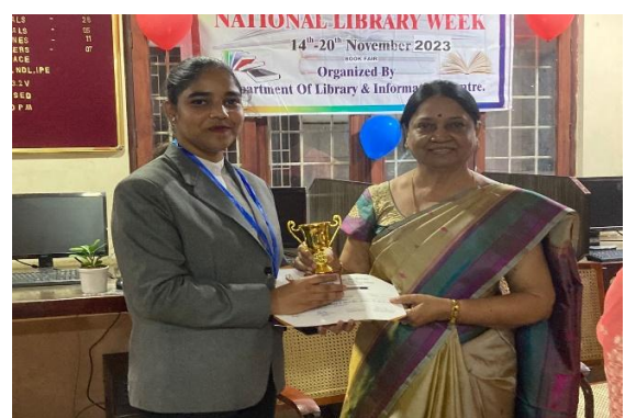
Best student Library User Award