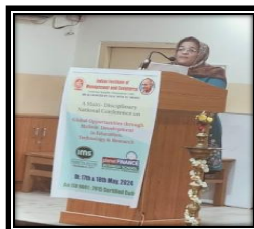
Research paper presented at IIMC