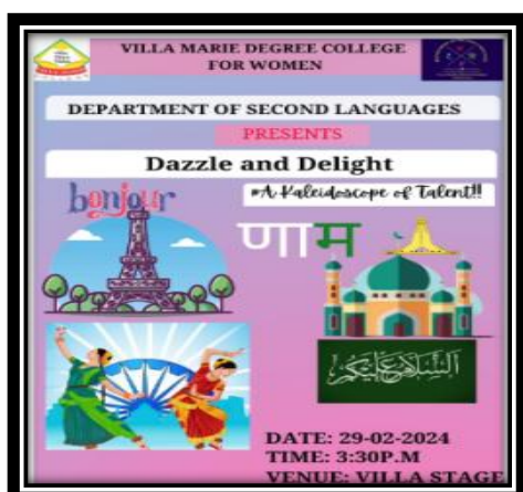
Dazzle & Delight