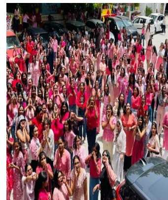
Barbie's Day Out