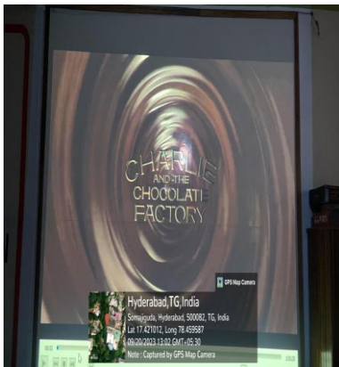
Roald Dahl's Birthday