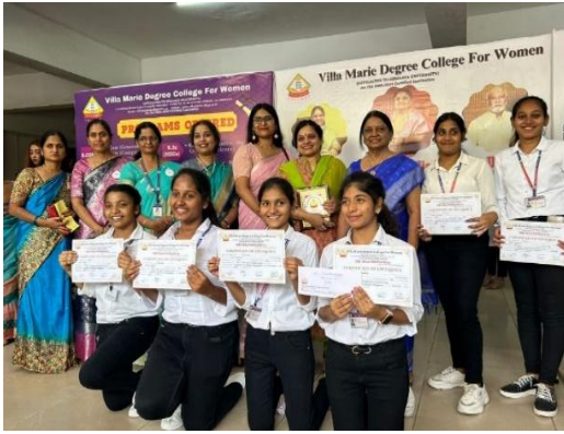
Street Play (Villa Conclave 2.0)