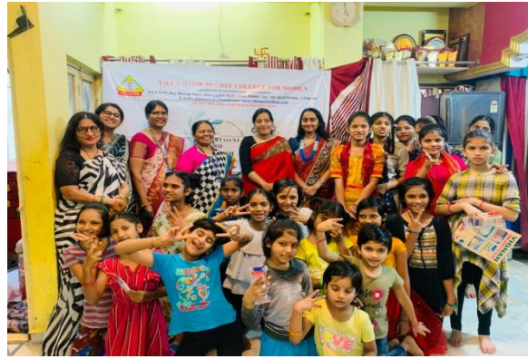
A visit to the Orphanage