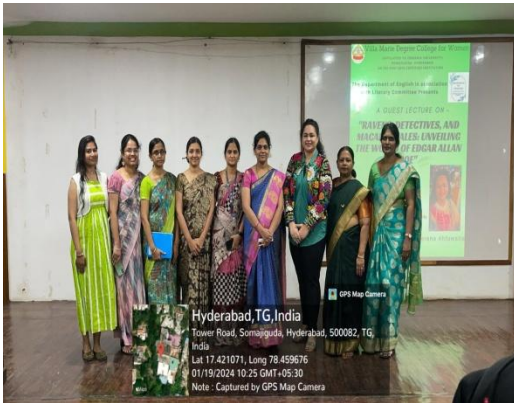
Edgar Allan Poe's Birthday