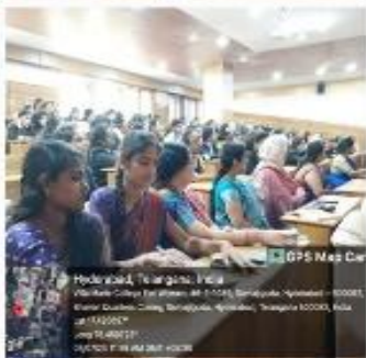
Workshop on "Glowing Skin and Healthy Hair"