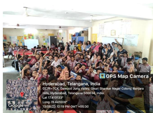
National Nutrition Week