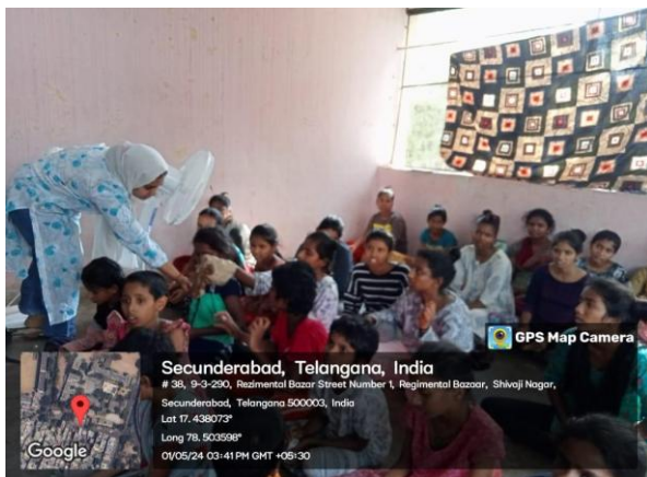
Visit to Orphanage by B.Sc Maths & Statistics

Through these diverse initiatives, Villa Marie Degree College for Women exemplifies a strong commitment to institutional social responsibility. Each department plays a vital role in fostering a sense of community, promoting social awareness, and encouraging students to engage actively in service-oriented activities.