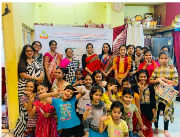
Visit to Navjeevan Anaath Ashram