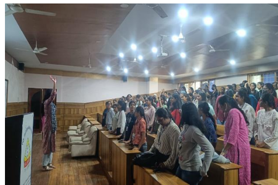
Soft skills offline Classes