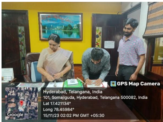
MOU with Storytech