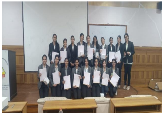
Synchrony Selected Students with Offer Letters