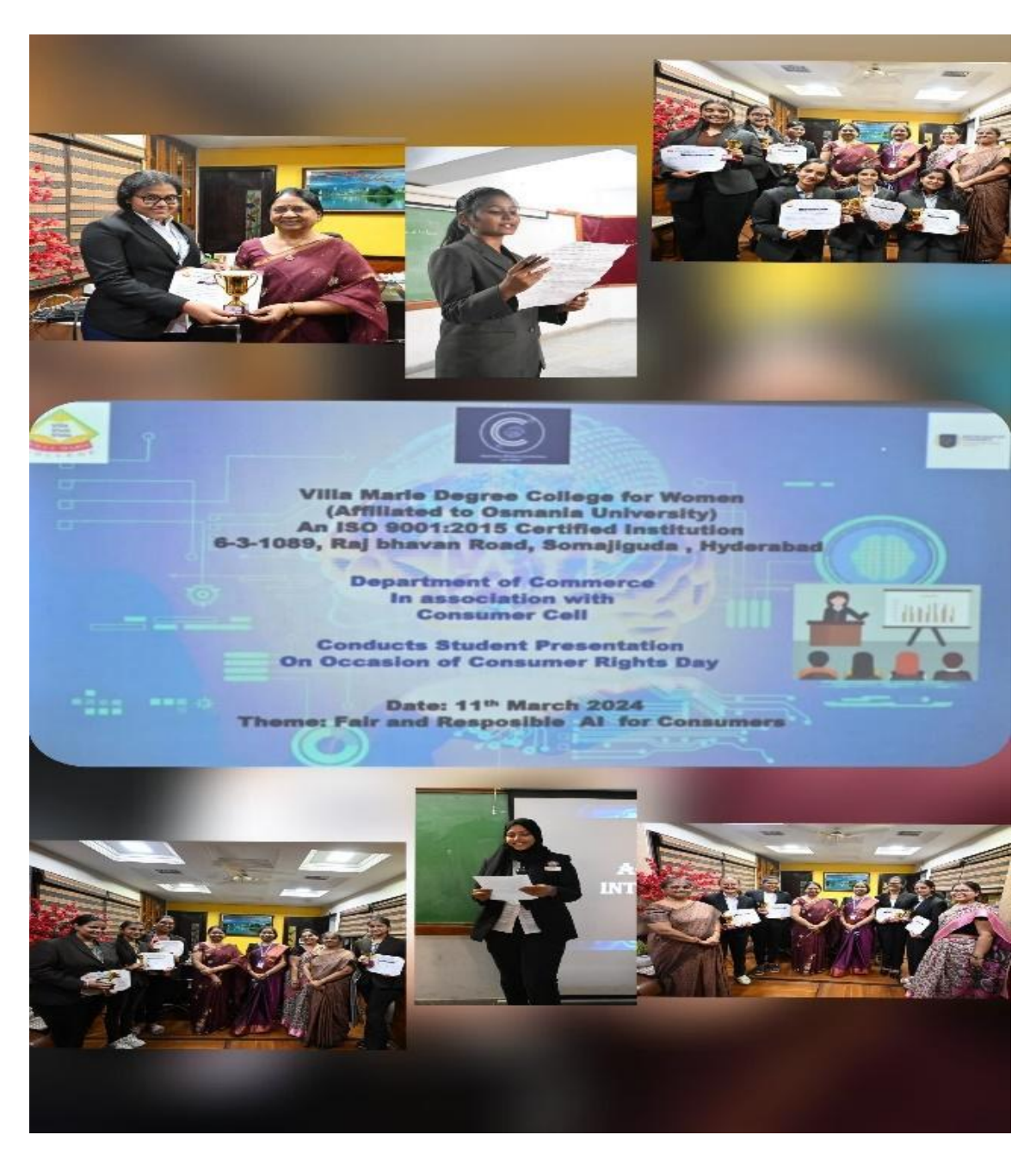
Poster Making and Presentation Competitions